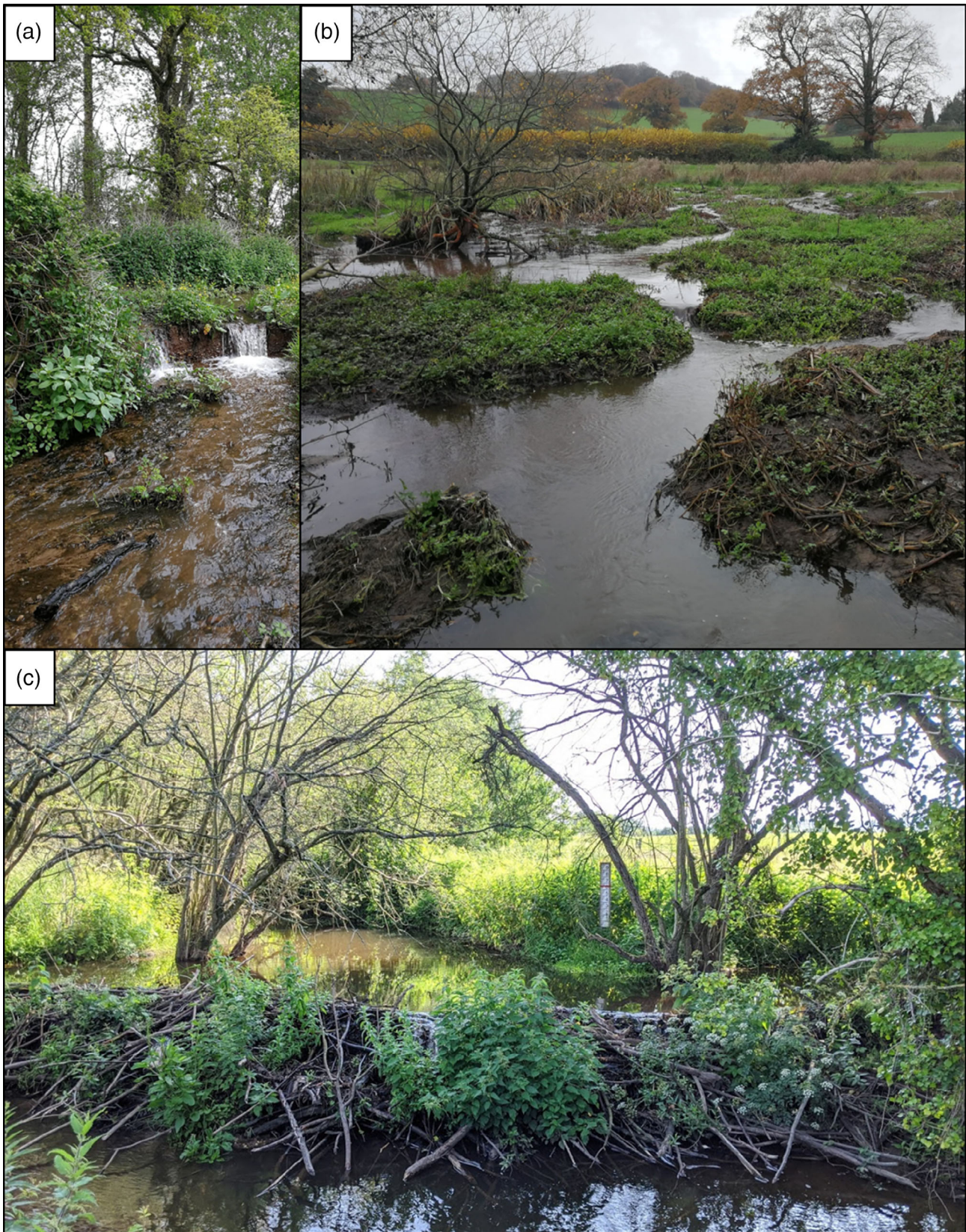
FIGURE 1 Examples of dam construction and channel avulsion resulting from beaver dam construction from the River Otter catchment, England. Panel (a) shows an example where a divergent flow path has re-entered the main channel resulting in head-cut erosion. Panel (b) shows the type of multi-thread channel form that occurs downstream of dams in wide, low gradient floodplains. Panel (c) shows a beaver dam on a 4th order stretch of river.